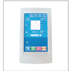
Optional (Touching panel)